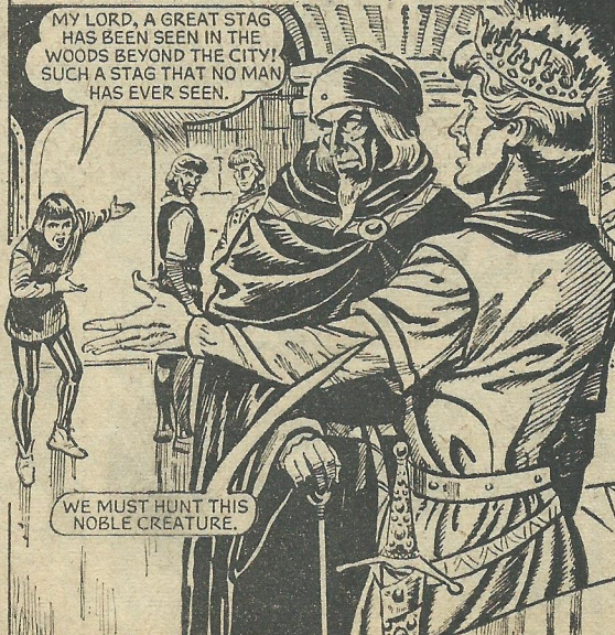
Next morning, as Arthur talked to Merlin, his adviser.

MY LORD, A GREAT STAG HAS BEEN SEEN IN THE WOODS BEYOND THE CITY! SUCH A STAG THAT NO MAN HAS EVER SEEN.