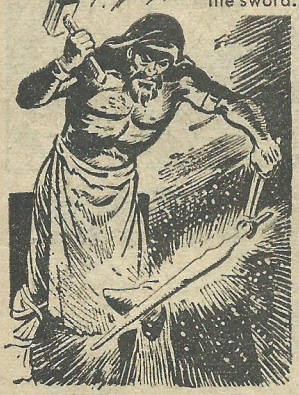
The smith worked hard fashioning the sword.

Several days later. THE WORK IS FINISHED, MY LADY. HERE IS THE SWORD AND SCABBARD.