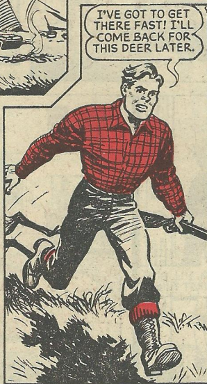
On his way back with meat, Broadaxe saw smoke.

I'VE GOT TO GET THERE FAST! I'LL COME BACK FOR THIS DEER LATER.