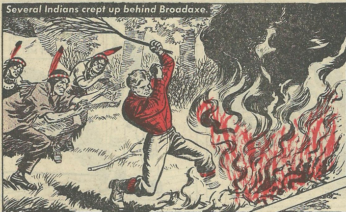
Several Indians crept up behind Broadaxe.

THE TOTEM POLE'S IN DANGER! I MUST TRY TO SAVE IT!