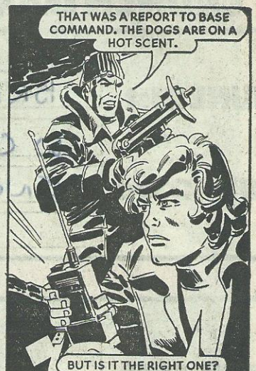
THAT WAS A REPORT TO BASE COMMAND. THE DOGS ARE ON A HOT SCENT.