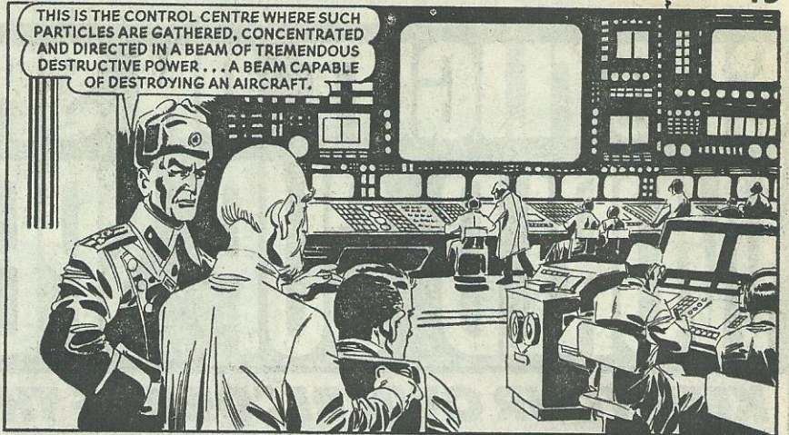
THIS IS THE CONTROL CENTRE WHERE SUCH PARTICLES ARE GATHERED, CONCENTRATED AND DIRECTED IN A BEAM OF TREMENDOUS DESTRUCTIVE POWER ... A BEAM CAPABLE OF DESTROYING AN AIRCRAFT.