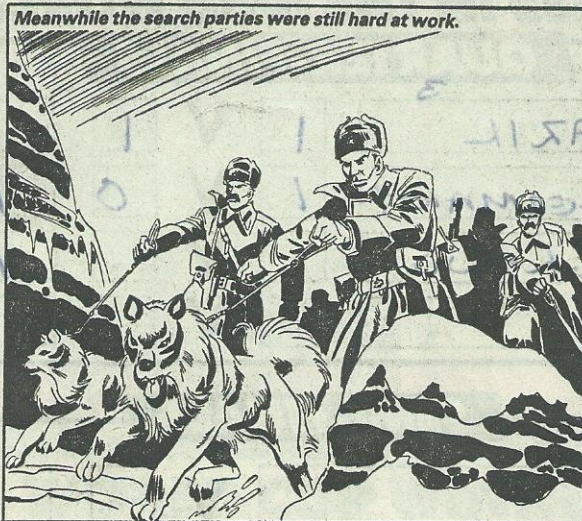
Meanwhile the search parties were still hard at work.