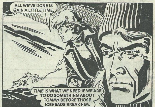
ALL WE'VE DONE IS GAIN A LITTLE TIME.

TIME IS WHAT WE NEED IF WE ARE TO DO SOMETHING ABOUT TOMMY BEFORE THOSE ICEHEADS BREAK HIM.