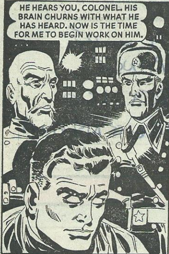
HE HEARS YOU, COLONEL. HIS BRAIN CHURNS WITH WHAT HE HAS HEARD. NOW IS THE TIME FOR ME TO BEGIN WORK ON HIM.