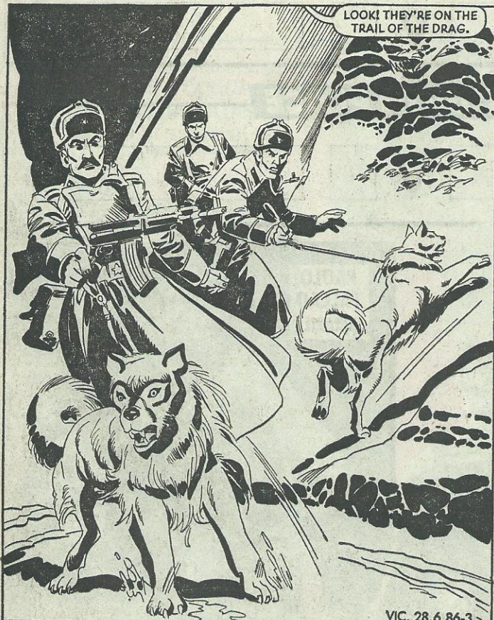
LOOK! THEY'RE ON THE TRAIL OF THE DRAG.