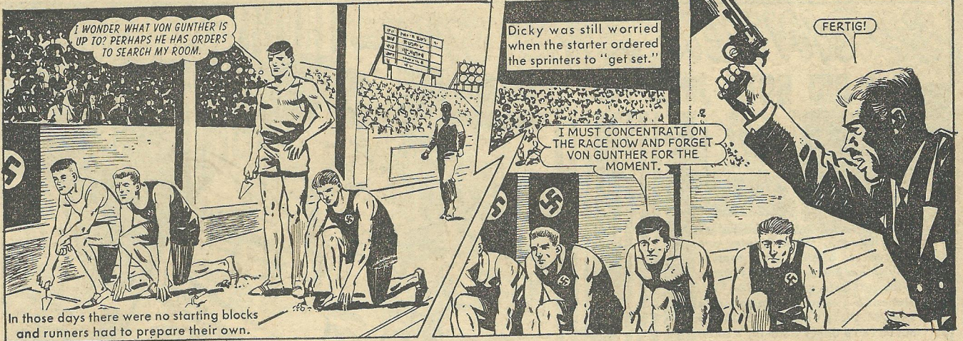
In those days there were no starting blocks and runners had to prepare their own.